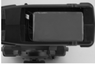
Radio with Battery

Use some soft foam such as Losi "Foam Battery Pads" Part Number – LOSA4015