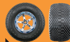
Super King Pin